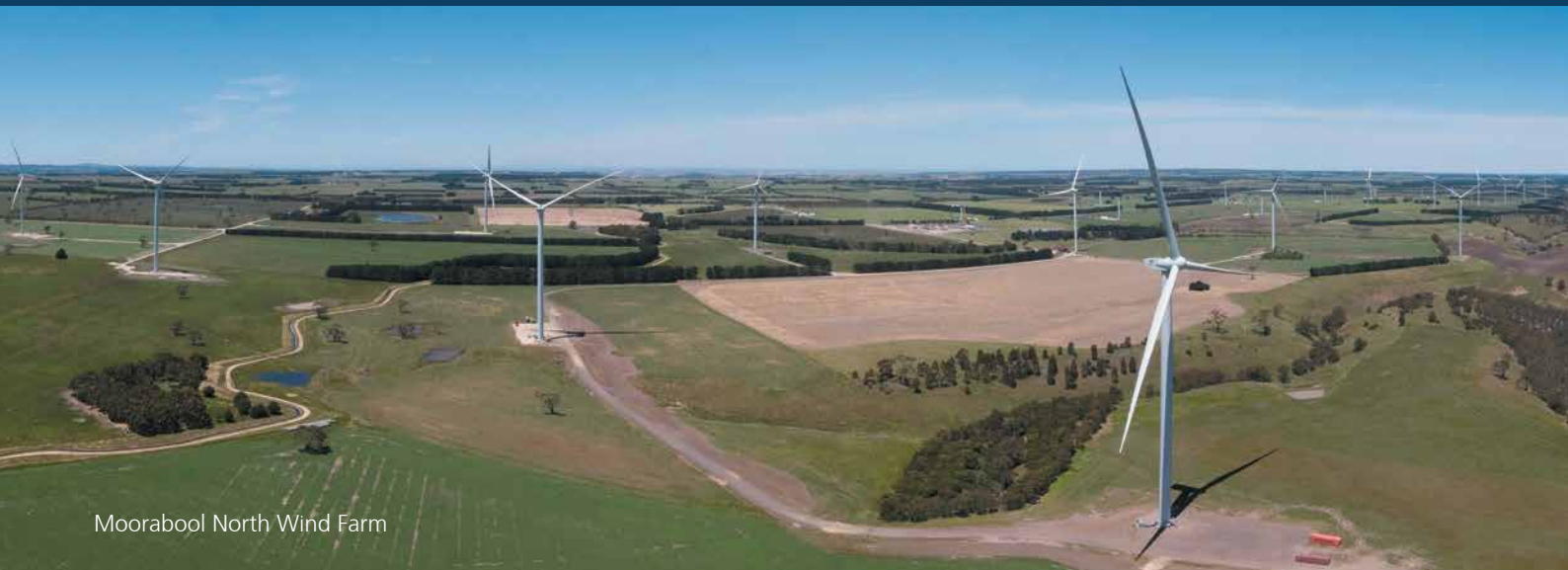
Moorabool North Wind Farm